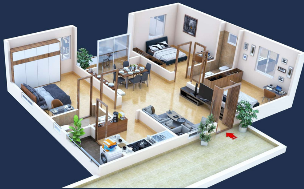
BLOCK-1 | FNO:11 | 1375 SFT | 3 BHK | EAST