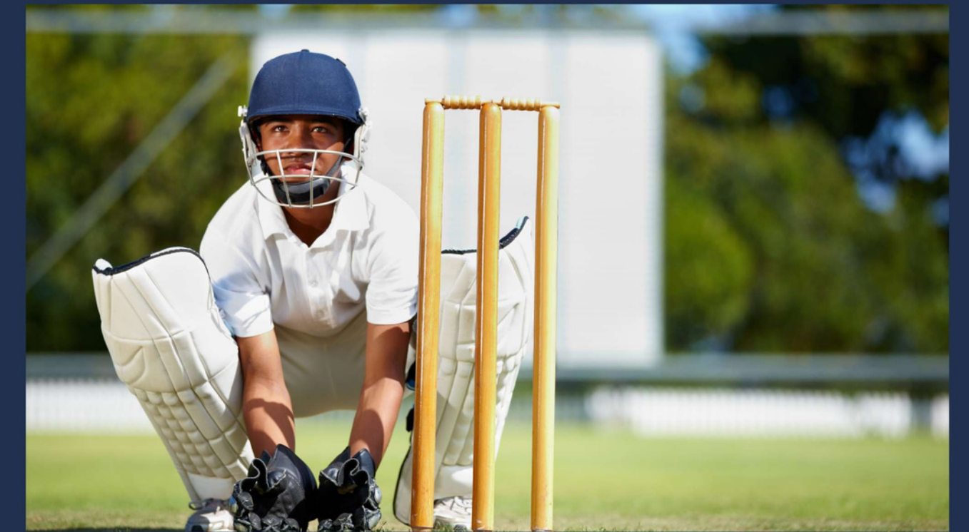
CRICKET PRACTICE NET