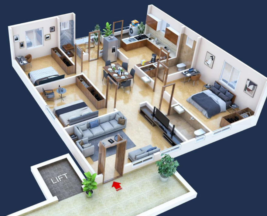
BLOCK-4 | FNO:5 | 1565 SFT | 3 BHK | WEST