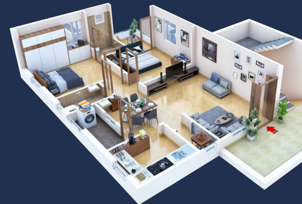
BLOCK-4 | F NO:6 | 1185 SFT | 2 BHK | EAST