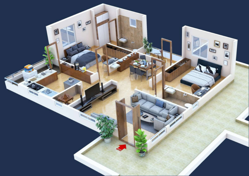
BLOCK-1 | F NO:6 | 1270 SFT | 2 BHK | EAST