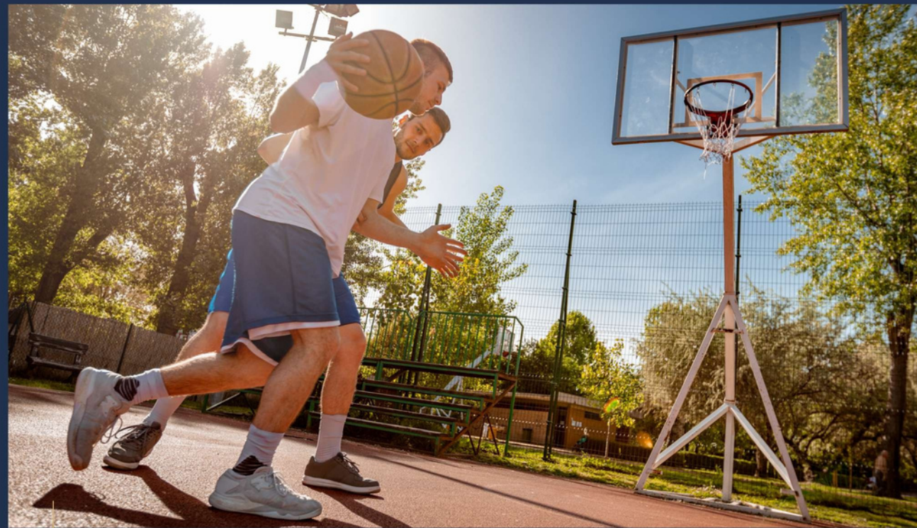
HALF BASKET BALL COURT