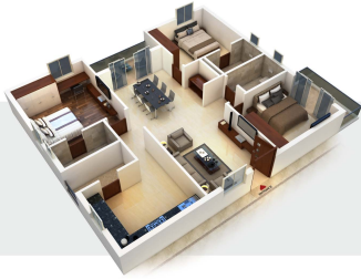
Flat: 5 | 1842 Sft. | 3 BHK | EAST