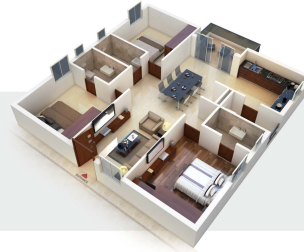
Flat: 1 - 4 | 1669 Sft. | 3 BHK | WEST