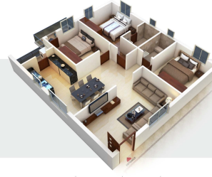
Flat: 8 | 1498 Sft. | 3 BHK | NORTH