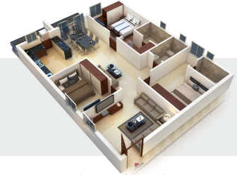
Flat: 9 | 1871 Sft. | 3 BHK | NORTH