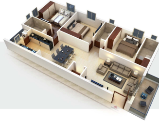
Flat: 19 | 1745 Sft. | 3 BHK | EAST