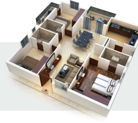
Flat: 14 | 1680 Sft. | 3 BHK | WEST