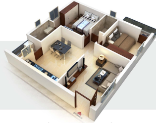
Flat: 21 | 1126 Sft. | 2 BHK | EAST