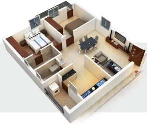
Flat: 15 | 1189 Sft. | 2 BHK | EAST