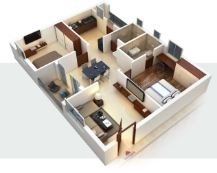
Flat: 10-13, 16-17 | 1224 Sft. | 2 BHK | WEST