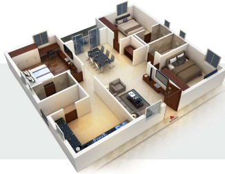
Flat: 6 - 7 | 1764 Sft. | 3 BHK | EAST